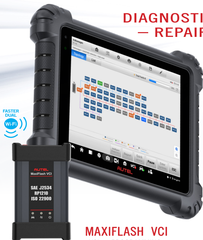
MAXIFLASH VCI VCI + PROGRAMMING