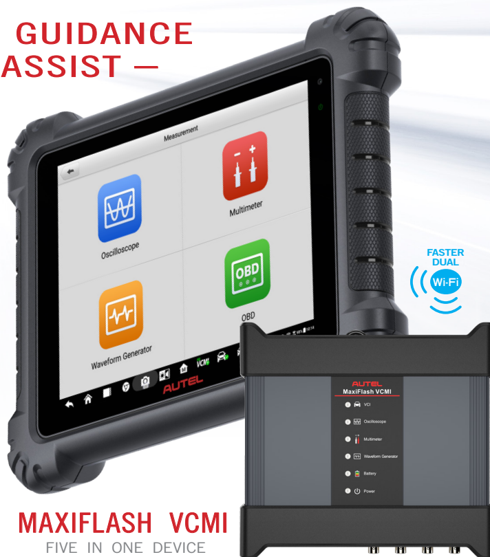
MAXIFLASH VCI FIVE IN ONE DEVICE